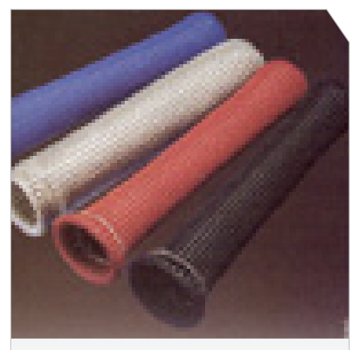
Design Engineering produces these sleeves designed specifically to protect the spark plug boots from heat damage, which can cause misfires.

In many cases, when it comes to stock car racing, coating a set of exhaust headers is preferable to wrapping them. But there are times when you require more insulation in specific areas — such as when the header runs right beside the starter. For those occasions, header sleeves work well.