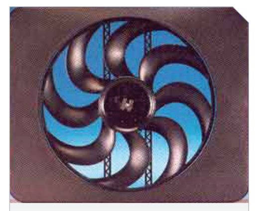
Whether you are using a mechanical fan or electric, a shroud will greatly increase its efficiency in terms of how much air it actually pulls through the radiator core. This Flex-a-lite electric fan comes with a built-in shroud — just make sure it covers at least 70 percent of the radiator's surface area.