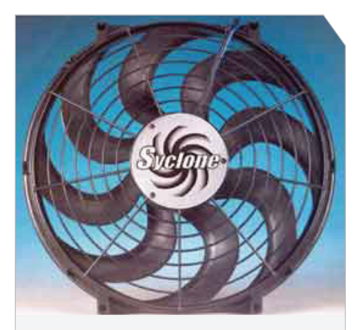
Electric fans are normally more efficient than mechanical radiator fans because they use their own motor and don't pull power from the engine.

Manufacturers such as B & M Racing Performance produce high performance oil coolers that not only provide good heat transfer from the oil to air with minimum size and weight, they are also very resilient in order to stand up to the abuses of racing. B & M produces a stacked-plate cooler, which you can literally stand on without damaging, and a cooler with an integral fan for providing extra cooling power when needed.