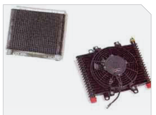
B B & M Racing Performance produces stacked plate oil coolers (left) that are designed to be both lightweight and virtually indestructible — perfect for racing. In applications where getting enough airflow is a problem, it also produces cooler air with integrated fans.